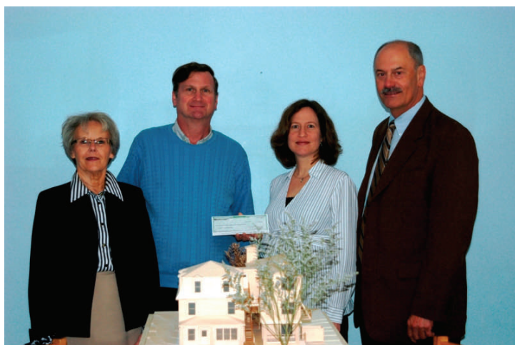
In April, Northwest Savings Bank presented HTI with a check for $2,500 for Raising More Than Money: The Campaign for Centre House.