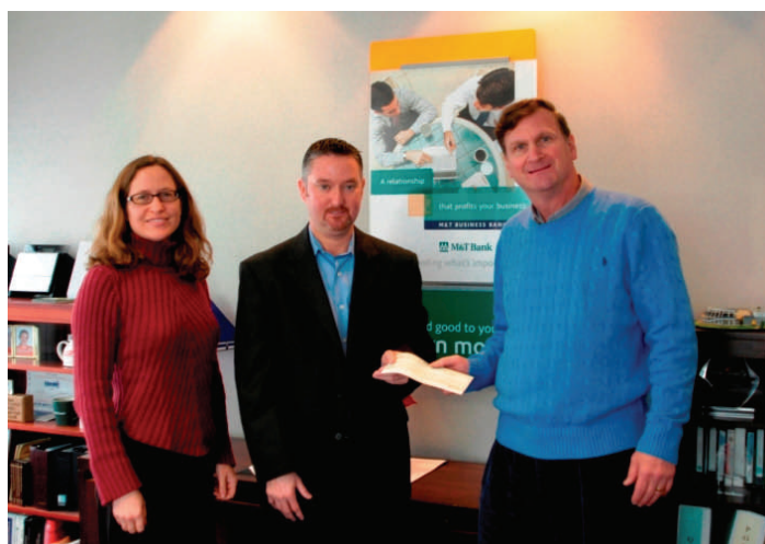
M&T Bank presented HTI with $5,000 in December 2009 to support our Home Buyers Education Program.

We would like to thank the Centre County Association of REALTORS for their support and gift from their second annual American Dream Housing Fund Auction held on February 26, 2010. As a result of the auction, CCAR representatives presented a check for $2,000 to HTI for Raising More Than Money: The Campaign for Centre House . Thank you to all CCAR members that support affordable housing in Centre County.