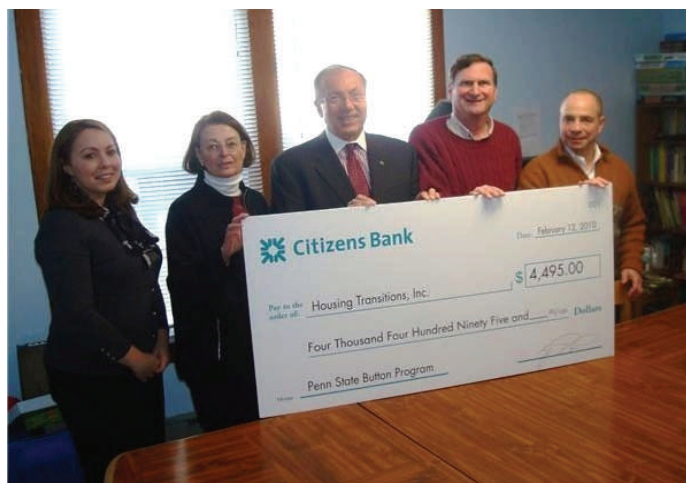
Citizen's Bank presented us with a check for $4,405 in February to support our Annual Fund from their annual sales of Nittany Lion's Football buttons.