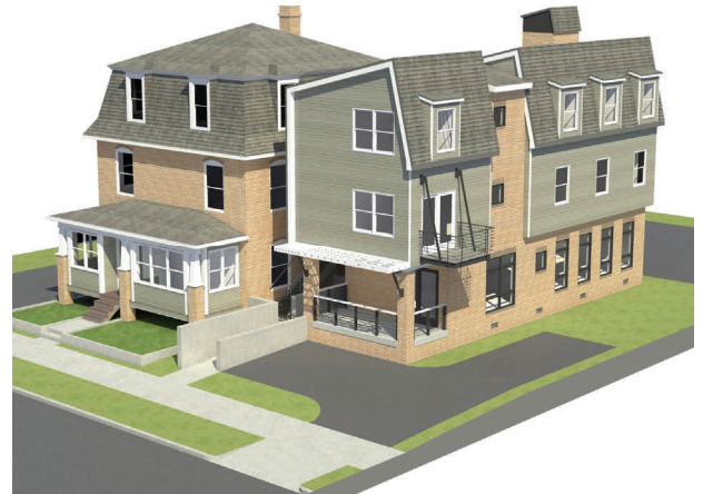
The original Centre House building, left, will undergo a renovation while a new addition, right, is constructed.

" Raising More Than Money is our largest ever fundraising effort. It will enable us to renovate our existing emergency shelter, Centre House, to improve safety, security, and privacy for our clients. It will also fund the building of an addition to expand our continuum of housing services to a segment of the population in great need of affordable housing--homeless